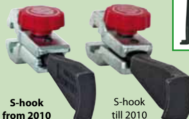
S-hook from 2010