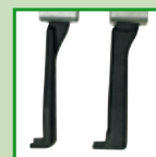
S-hook till 2010